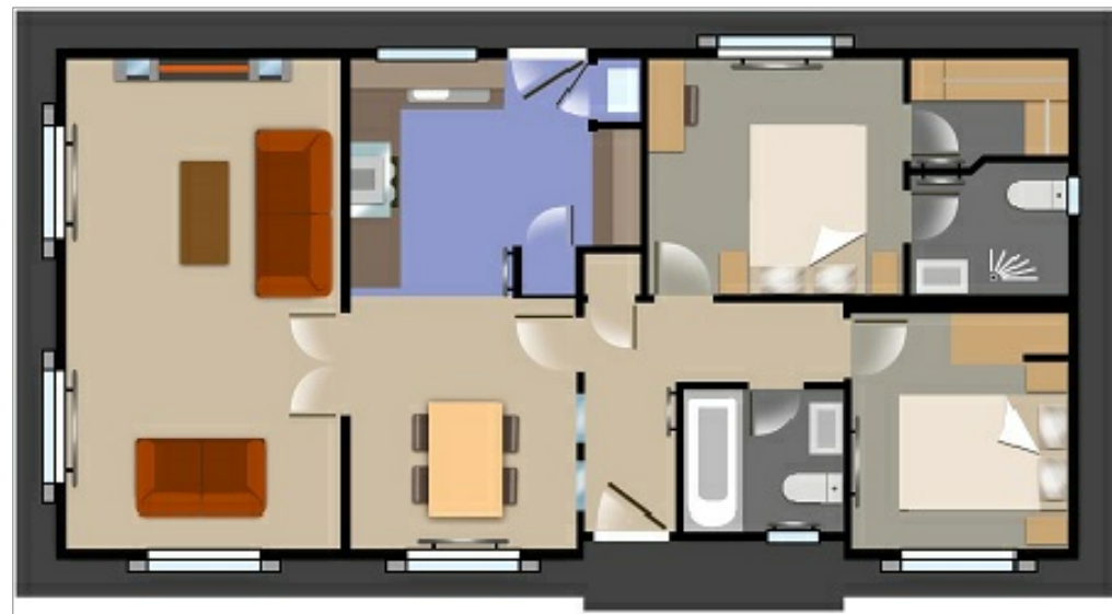
Typical Layout Plan